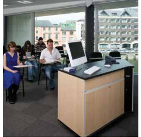
REHEARSAL RESOURCE CENTER

"Our building, its fleet of over 60 new Steinway grand pianos, and the thousands of items of Wenger equipment, have won many awards and been acclaimed as a world leader," concludes Spratt. "More importantly, thousands of students are flourishing as they use the instruments and equipment on a daily basis."