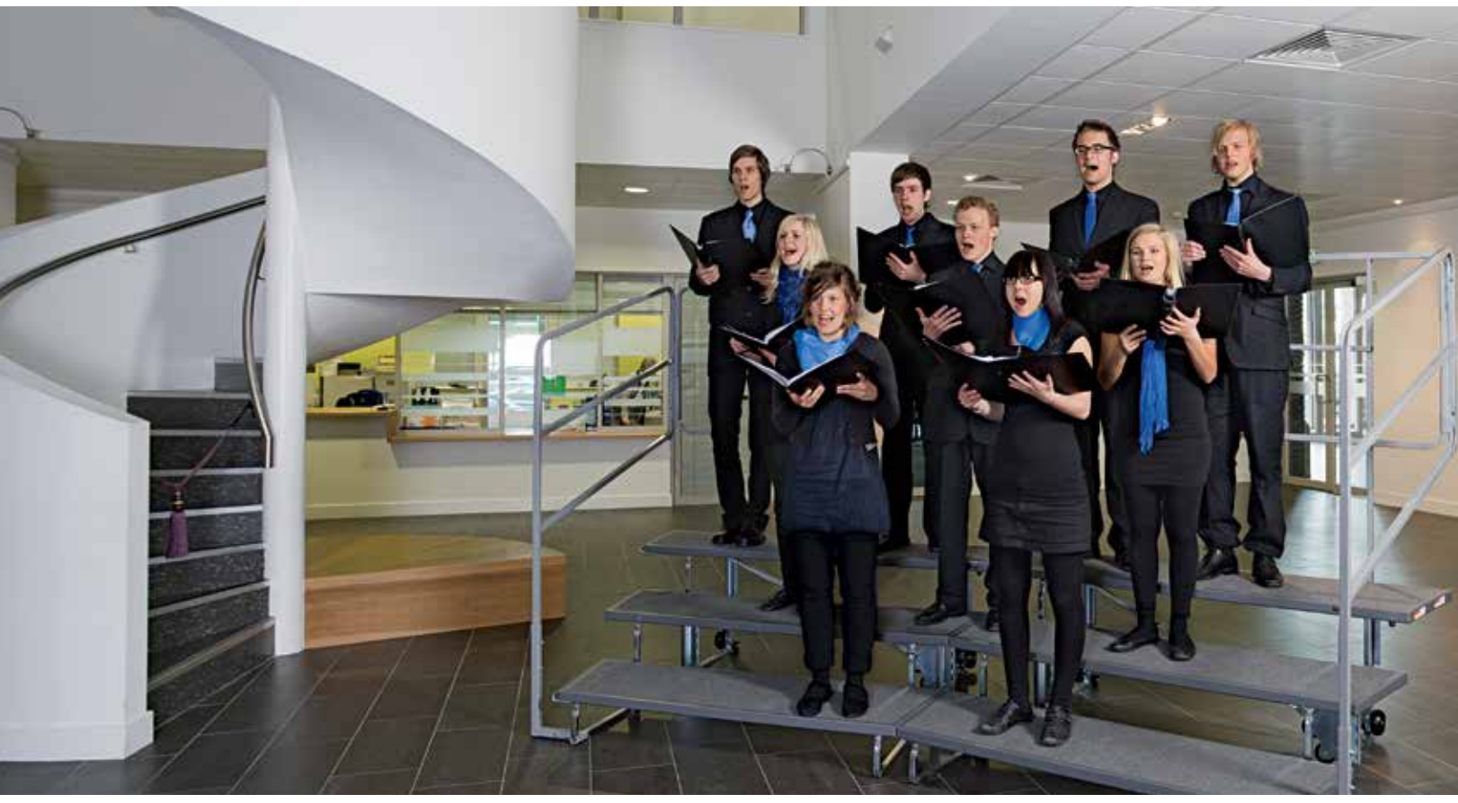
TOURMASTER® CHORAL RISERS